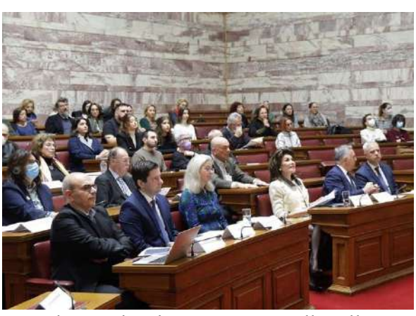
Speakers and audience, Senate Hall, Hellenic Parliament

available on a special website, a kind of portal on the Greek Revolution.